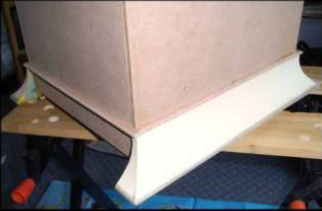
MDF BOX STRUCTURE WITH EXPANDED POLYSTYRENE COVING