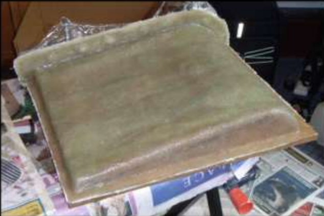
2 PART FIBREGLASS MOULD WITH FIBREGLASS LID CAST