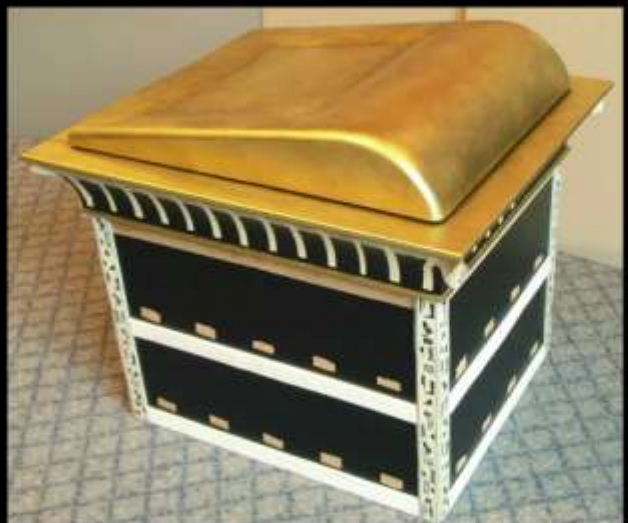
THE UNFURNISHED BOX STRUCTURE BEFORE AND AFTER APPLICATION OF GOLDFINGER AND FRENCH ENAMEL VARNISHES