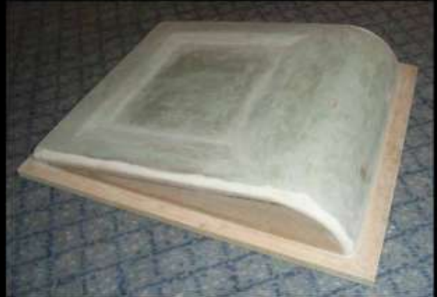
LID MASTER FOR TAKING A MOULD FROM. MDF CONSTRUCTION WITH BODY FILLER