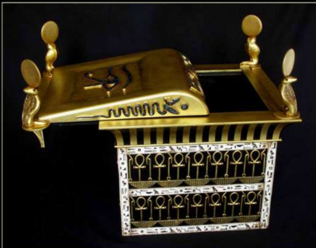
LID SLIDES OPEN